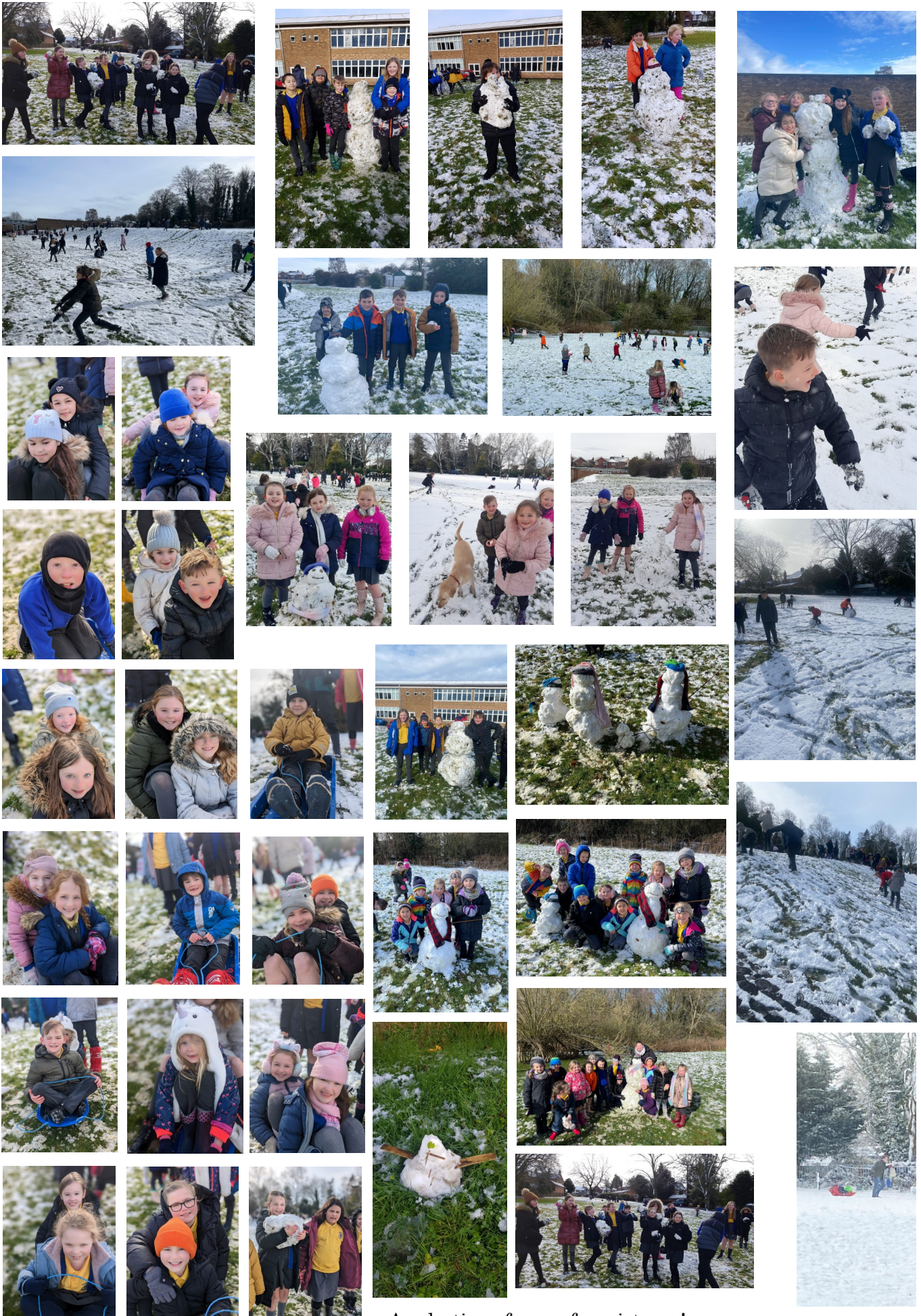
A selection of snow-fun pictures!