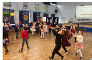
Year 3 enjoying their party on Monday.

← Information about applying for Primary School places. Don't leave applying until the last minute! Late applications don't always get the first choice school.